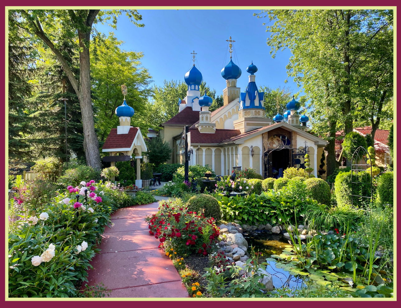
St. Sabbas Orthodox Monastery 18745 Old Homestead Harper Woods, Michigan 48225